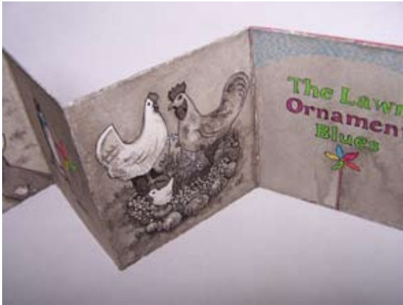
fold out book